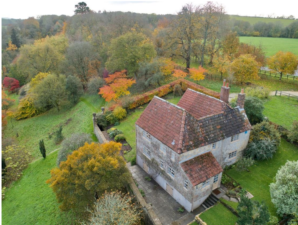
The Garden Cottage, Mapperton Estate

The Cottage offers comfort with modern furnishings and bathrooms. With two double rooms and a single room and two full bathrooms, this would suit a family or group of friends.