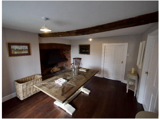
The Cottage kitchen and dining area, Mapperton Estate