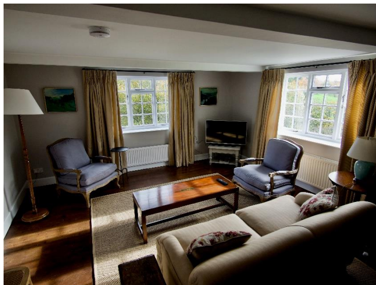
The Cottage Lounge, Mapperton Estate