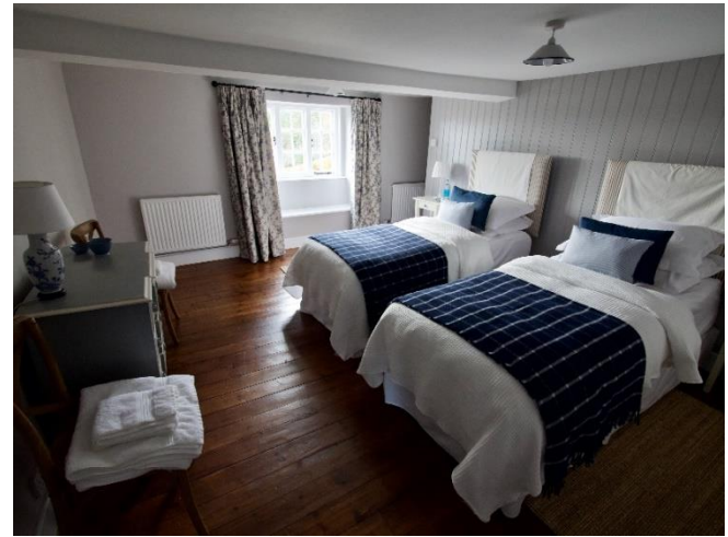
The Cottage double rooms, Mapperton Estate