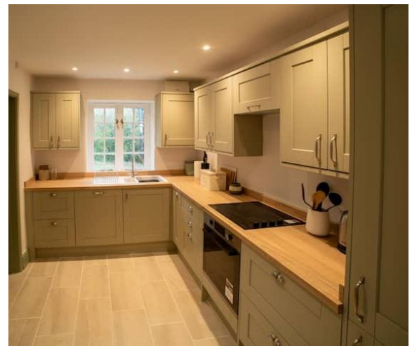
Keeper's Cottage, double bedroom, lounge and kitchen, Mapperton Estate